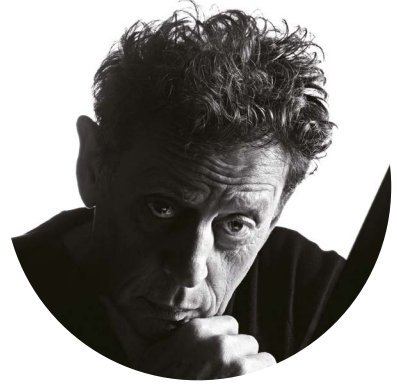
Philip Glass (philipglass.com)

Movement I Movement II Movement III Movement IV