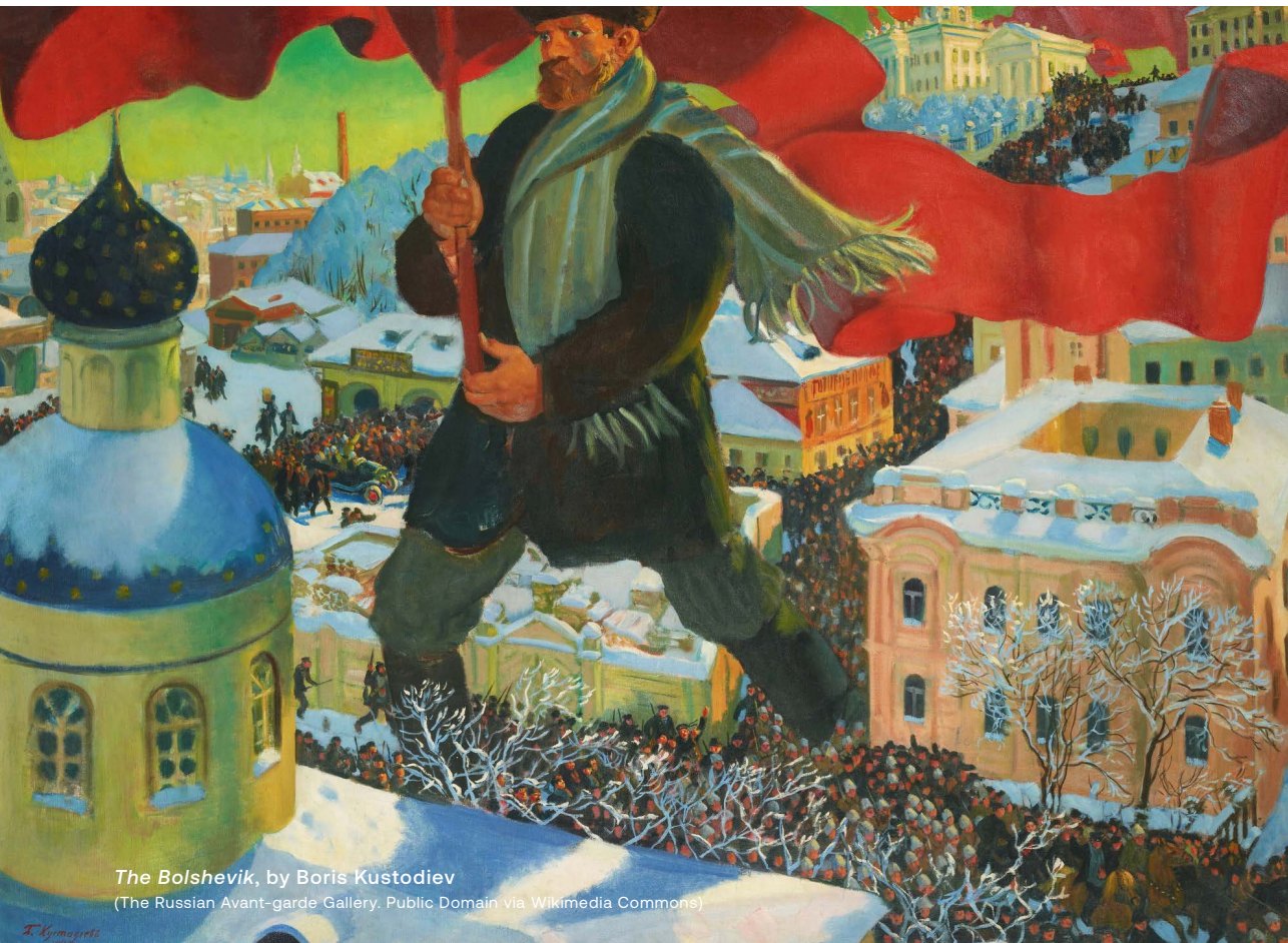
The Bolshevik , by Boris Kustodiev (The Russian Avant-garde Gallery, Public Domain via Wikimedia Commons)