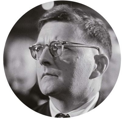
Shostakovich

If Shostakovich's String Quartet no. 8 sounds sad, it may be because the composer was feeling particularly depressed at the time. He was frustrated with being forced to join the Communist Party and dedicated the work to the victims of the war and fascism. When the four members of the Borodin Quartet played it for Shostakovich, he was so overwhelmed by emotions that he buried his head in his hands and wept.